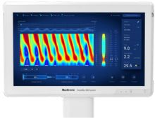
Endoflip™ 300 impedance planimetry system*

Discover our GI portfolio at booth #3520