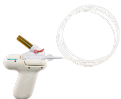
Nexpowder™* endoscopic hemostasis system