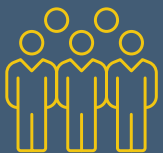
EXHIBIT HALL STATS